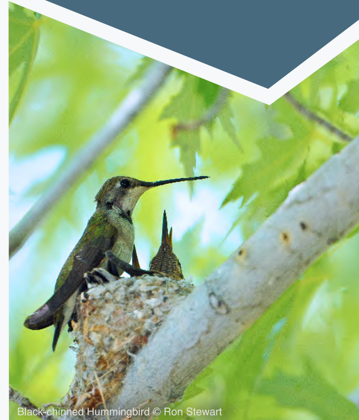
Black-chinned Hummingbird

How to Avoid Illegal "Take" of Birds During Tree Trimming, Brush Removal and Other Improvement Projects